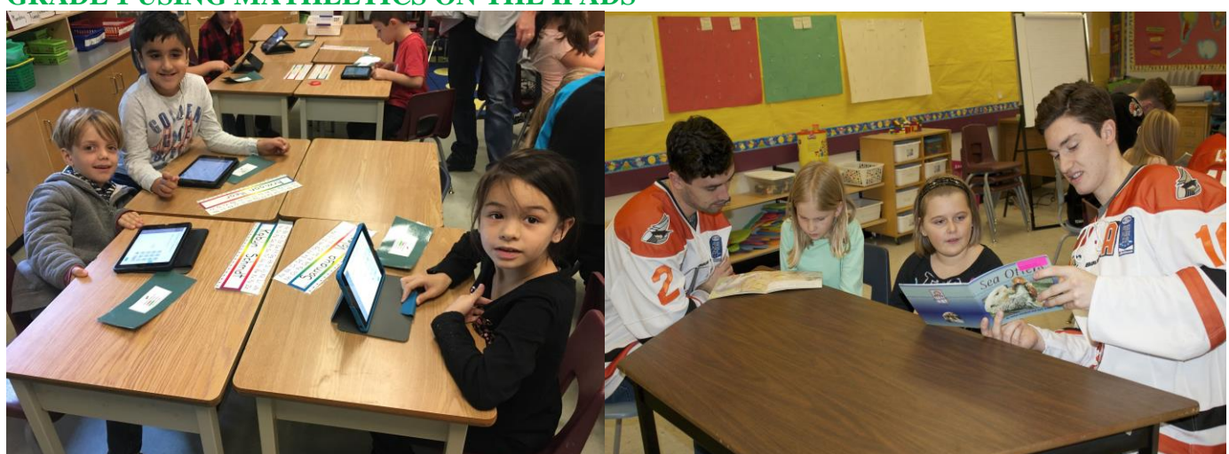
CLIPPERS READING WITH OUR STUDENTS AT DROP EVERYTHING AND READ