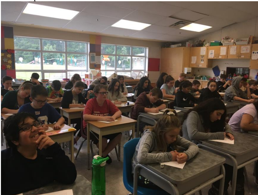
Winning BC/Yukon for Remembrance Day Essay