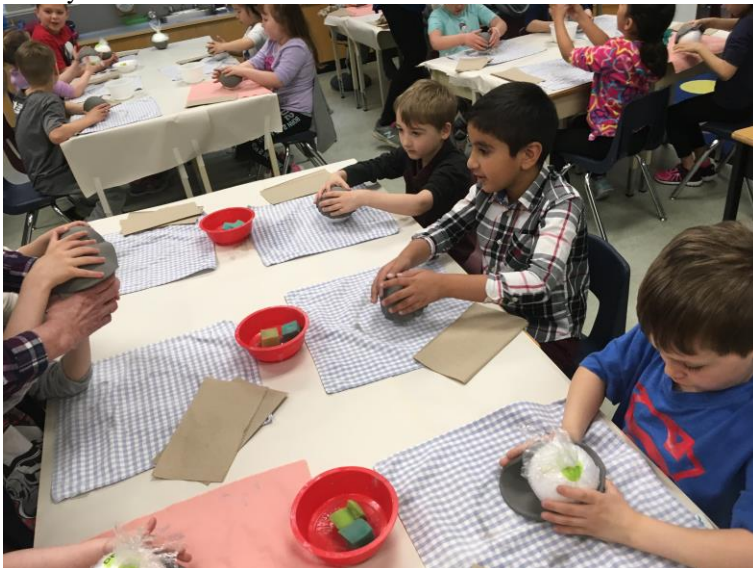
Splash and Dash